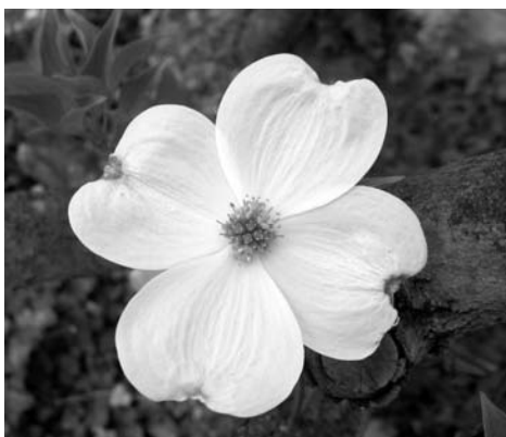
Dogwood Virginia State Flower

Most of Virginia's cities also constitute school divisions, with those entities being served by School Boards and School Superintendents in the same manner as county school divisions. Prior to 1994, all the School Boards serving city school divisions were appointed by city council. However, as a result of the previously cited 1992 legislation, most of Virginia's cities have established, by referendum, a process for the election of such officials by the voters. The initial election of city School Boards occurred in 1994. In addition, two towns (Colonial Beach and West Point) constitute school divisions.