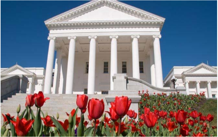
State Capitol Building Richmond, Virginia Spring, 2014