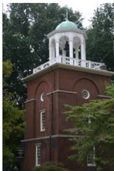
Bell Tower State Capitol Grounds Richmond, Virginia

If an election results in a tie, the winner is determined by lot. This is done by the State Board of Elections for national or state officers and by the local electoral board for its respective county, city, or town officers. After the official canvass or lot determination, certificates are issued to the successful candidates who must take and subscribe the oath of office required by the Constitution of Virginia before assuming office.