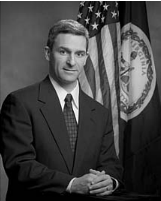
Attorney General Kenneth T. Cuccinelli, II

Included in this publication are brief sections describing the nature and function of Virginia's legislative and judicial processes. These sections help the reader to understand the interrelationship among the legislative, judicial, and executive branches of government.