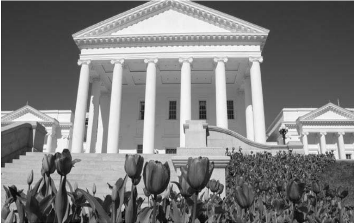
State Capitol Building Richmond, Virginia Spring, 2010