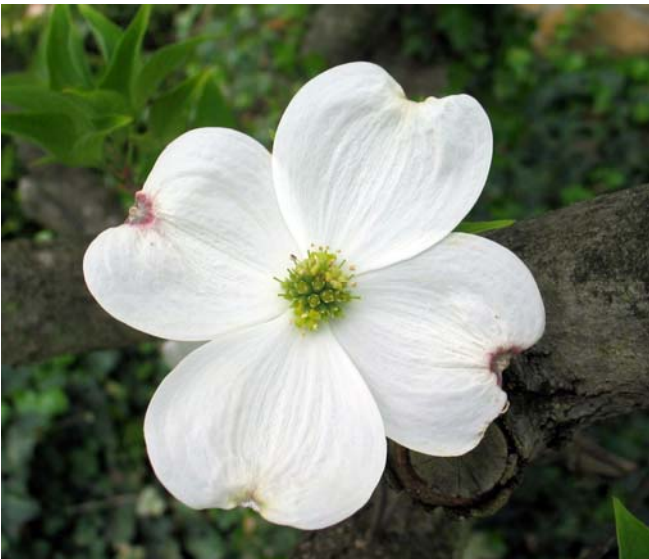
Dogwood Virginia State Flower

operates under the authority of both Federal and State statutes. It helps with disability-related problems like abuse, neglect, and discrimination and also helps people with disabilities obtain services and treatment.