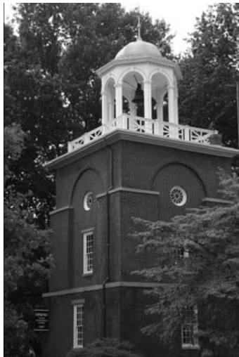
Bell Tower State Capitol Grounds Richmond, Virginia

If an election results in a tie, the winner is determined by lot. This is done by the State Board of Elections for national or state officers and by the local electoral board for its respective county, city, or town officers. After the official canvass or lot determination, certificates are issued to the successful candidates who must take and subscribe the oath of office required by the Constitution of Virginia before assuming office.