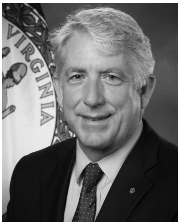
Attorney General Mark R. Herring

Included in this publication are brief sections describing the nature and function of Virginia's legislative and judicial processes. These sections help the reader to understand the interrelationship among the legislative, judicial, and executive branches of government.